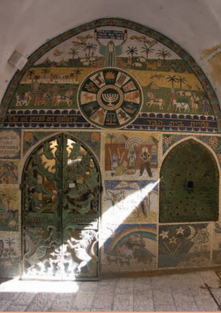
Counterclockwise from above: Entrance to the Oil Press Art Gallery - the light beam just happened to be there when I took the picture. Oil Press stones. Smudging during class inside the gallery. There are miles of streets like this. Another street scene. Doorway to the ancient wall that surrounded Solomon's Temple.