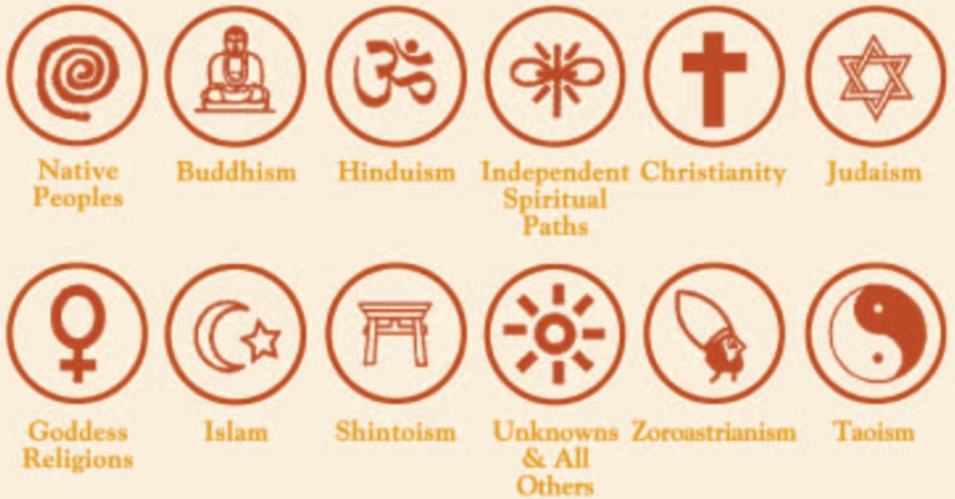
Symbols on the World Peace Crystal Grid

tures have been passed out, and copies of all three are at the end of this article. Copies of all the pictures can also be downloaded from our web site at www.reiki.org .